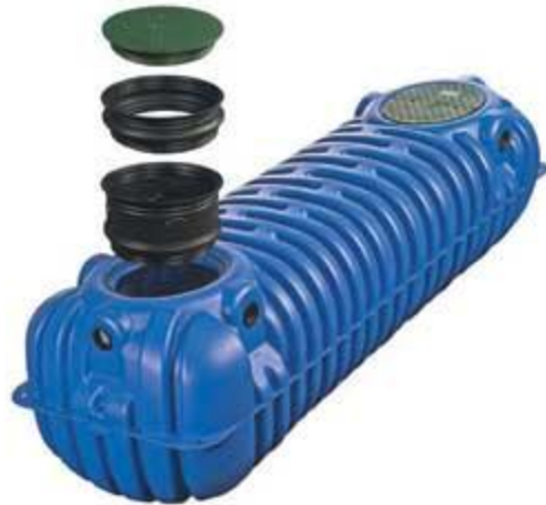
Figure 3: Typical Fralo Plastic Tank