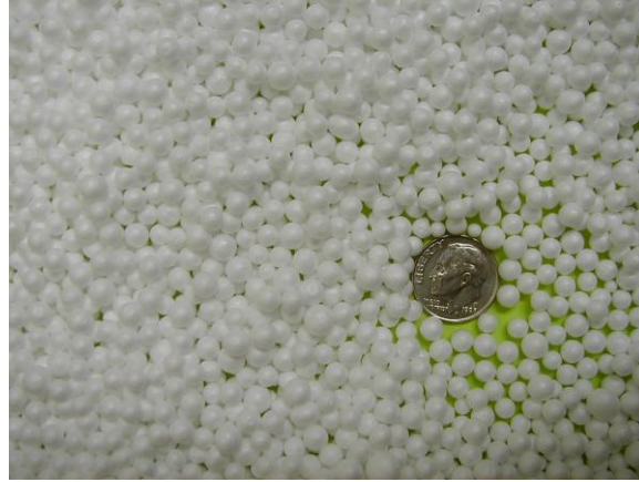
Figure 4: SeptiTech Bead Media