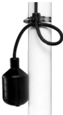
Figure 8: Typical Mechanical Float