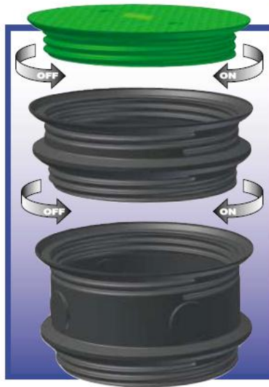
Figure 2: Typical Plastic Access Hatch