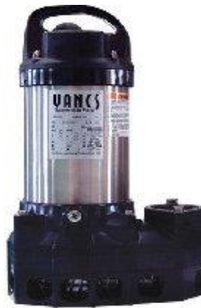
Figure 6: Tsurumi VANCS Series Submersible Pump (Typical)

The pump manufacturers that SeptiTech uses are Tsurumi America, Inc. and ITT Goulds/Xylem. The pumps are constructed of stainless steel and fiberglass reinforced plastics (FRP) making them highly resistant to corrosion. The impellers are also constructed of FRP allowing for the passage of solids, stringy materials, and resistance to wear when pumping abrasive materials.