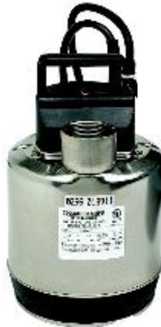
Figure 7: GOULDS Series Submersible Pump